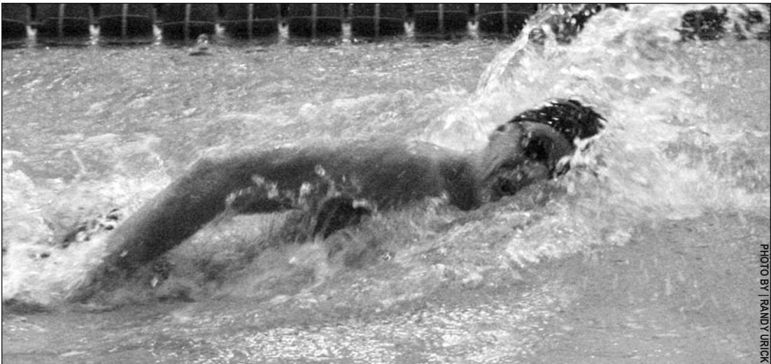
George Mason University will host the CAA Conference Championships this weekend.